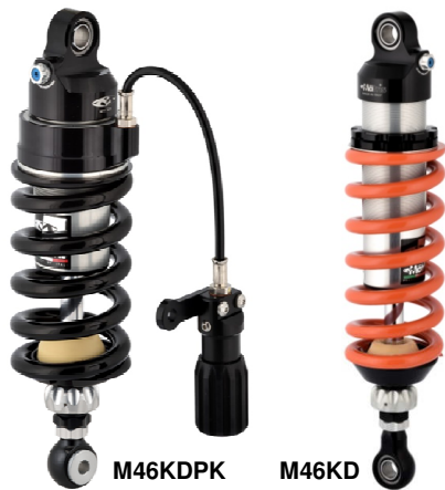
M46KDPK M46KD on demand Dark Series