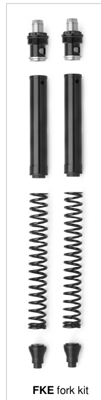
FKE fork kit

R = Rebound adj. / regolazione Estensione L = Length adj. / regolazione Interasse P = standard spring Preload / Precarico molla standard HP = hydraulic spring Preload adj. / Precarico molla idraulico