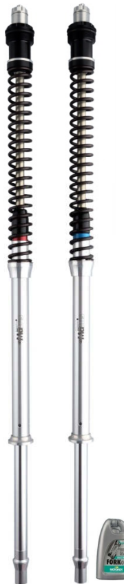
F15K "from conventional non-adjustable to fully-adjustable fork"