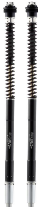
F25R Quad-valve asymmetric system