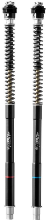
F25SA Sealed cartridge asymmetric system