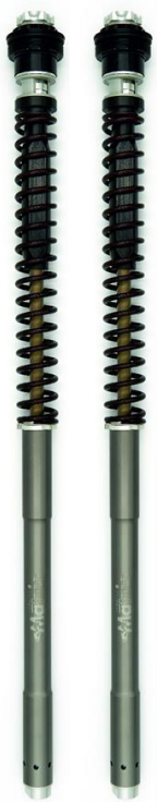
F20K Quad-valve asymmetric system