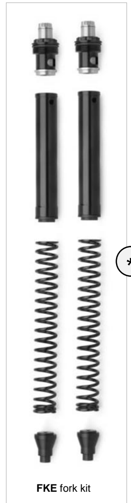
FKE fork kit