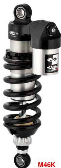
Dark Series (on demand)