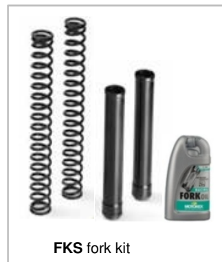
FKS fork kit