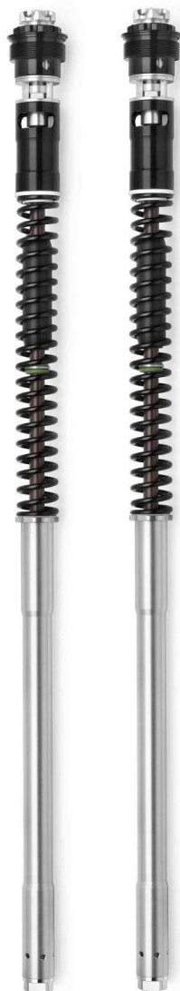
F20K fork kit