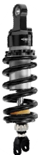
on demand Dark Series