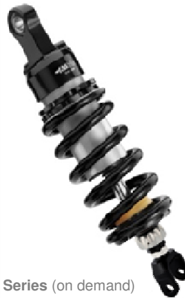
Dark Series (on demand)