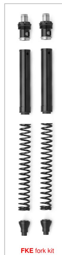
FKE fork kit