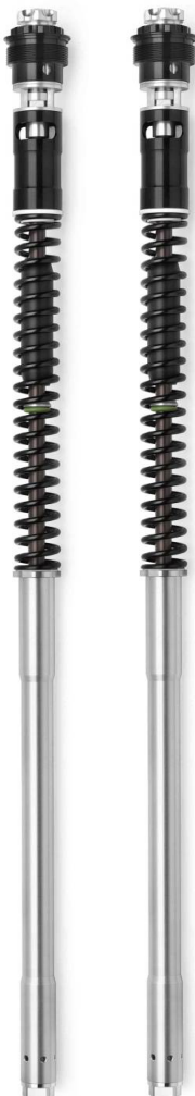
F20K fork kit