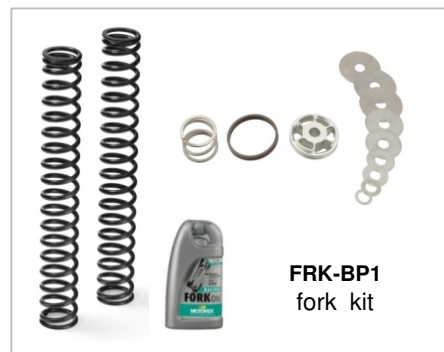
FRK-BP1 fork kit

on demand the technopolymer fork cap tools