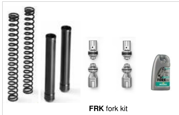
FRK fork kit