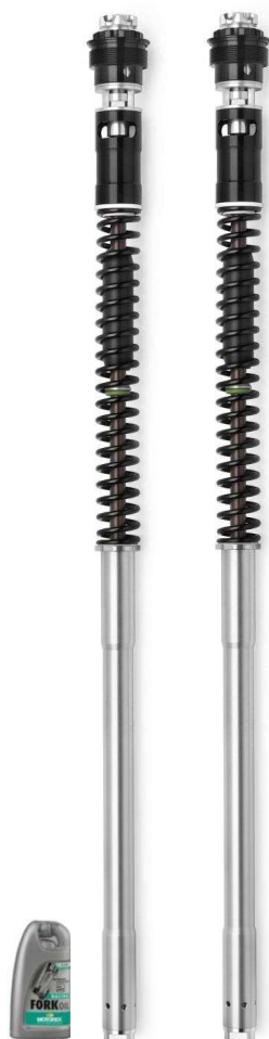
F20K fork kit