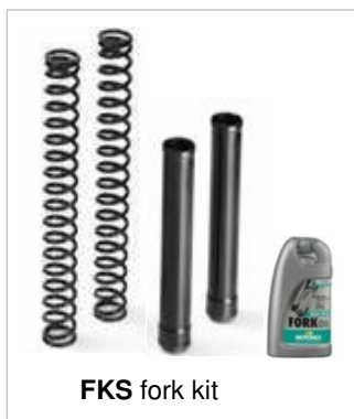
FKS fork kit