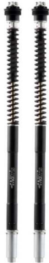
F25R fork kit