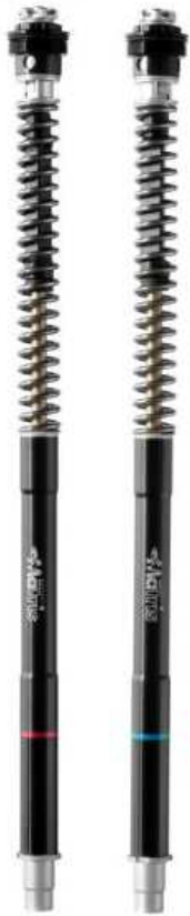
F25SA fork kit