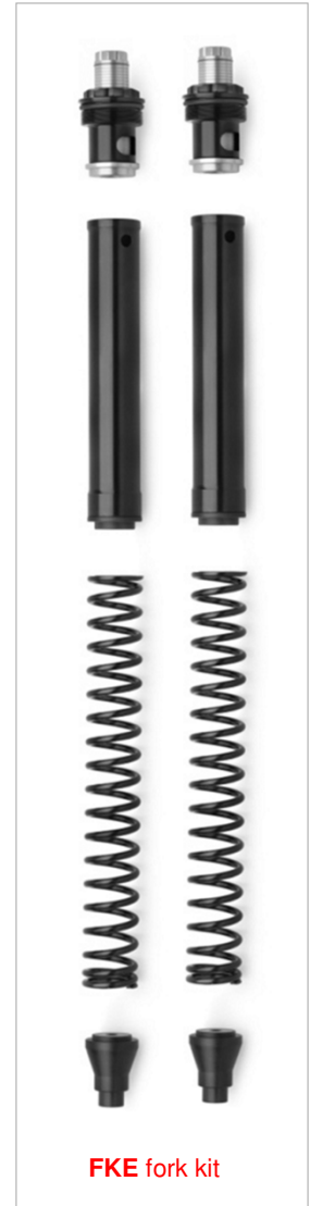
FKE fork kit