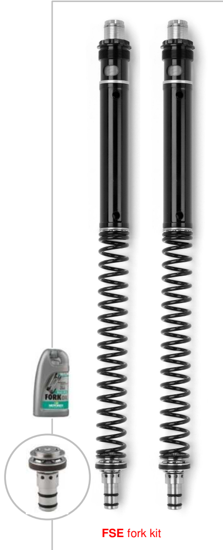
FSE fork kit