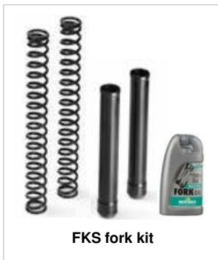
FKS fork kit