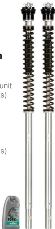
F20K fork kit