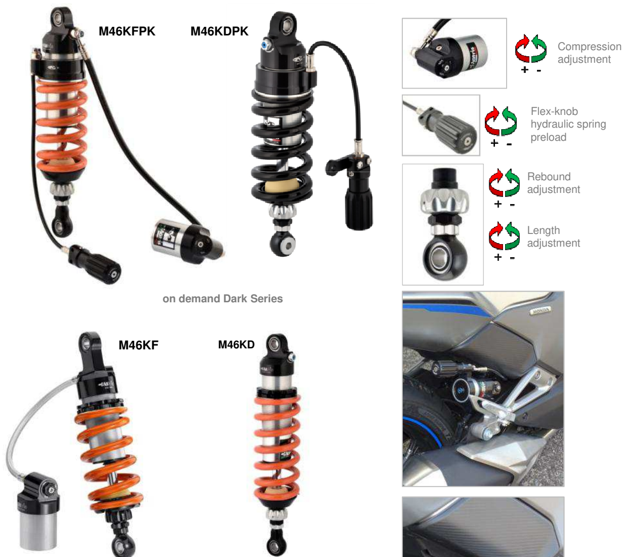
on demand Dark Series

C = Compression adj. / regolazione Compressione R = Rebound adj. / regolazione Estensione L = Length adj. / regolazione Interasse P = standard spring Preload / Precarico molla standard HP = hydraulic spring Preload adj. / Precarico molla idraulico