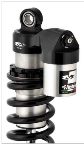
front / anteriore M40K (adjustment: C–R–L–P)