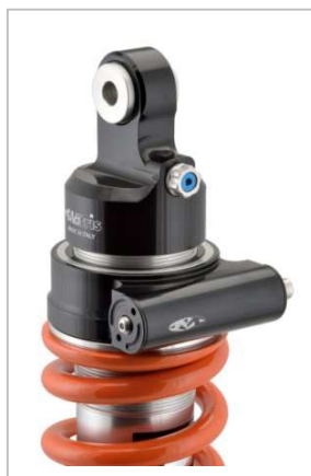
rear / posteriore M46KD (adjustment: R–L–HP)