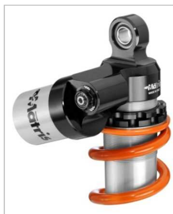
rear / posteriore M46K (adjustment: C–R–L–HP)