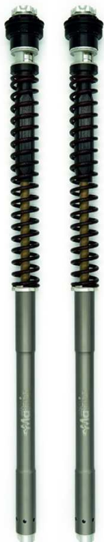
F20K Quad-valve asymmetric system