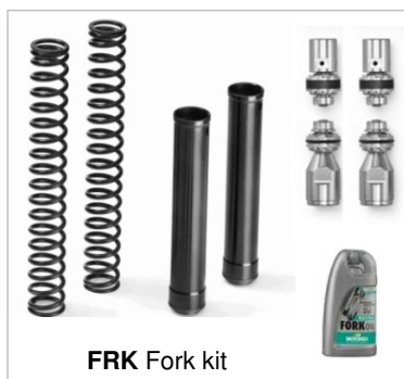
FRK Fork kit