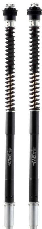
F25R Quad-valve asymmetric system