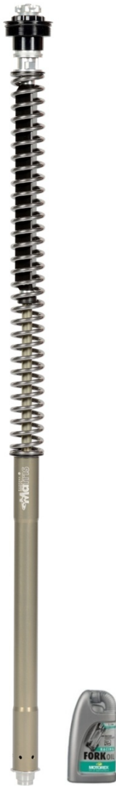
F25RX Fork kit

(*) single cartridge kit – Rebound & Spring Preload adjustment (right fork side only)