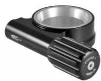
IK knob-hydraulic spring preload