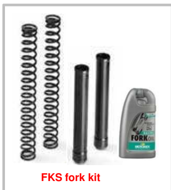
FKS fork kit