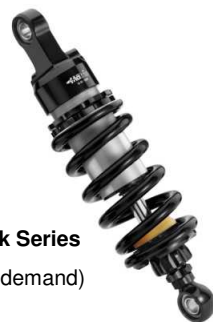
Dark Series (on demand)

C = compression adj. / regolaz. Compressione R = rebound adj. / regolaz. estensione L = length adj. / regolaz. Interasse HP = hydr. spring preload adj. / precarico molla idr.