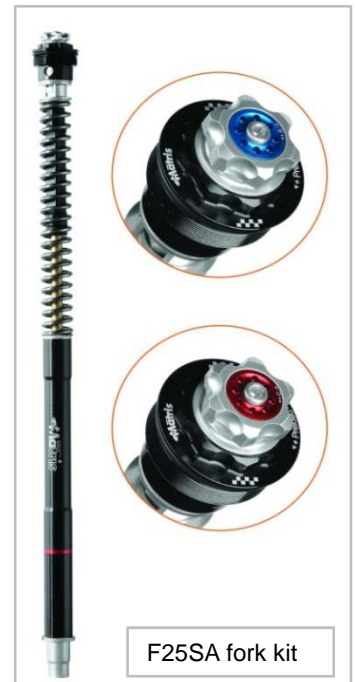
F25SA fork kit

CH = HighSpeed Comp. adj. / regolaz. Compres. Alta Velocità CL = LowSpeed Comp. adj. / regolaz. Compres. Bassa Velocità C = compression adj. / regolaz. Compressione R = rebound adj. / regolaz. estensione L = length adj. / regolaz. Interasse P = std spring preload / precarico molla std HP = hydraulic spring preload adj. / precarico molla idraulico