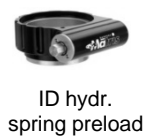
ID hydr. spring preload