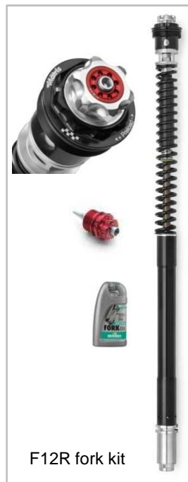
F12R fork kit