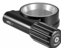
IK knob-hydraulic spring preload