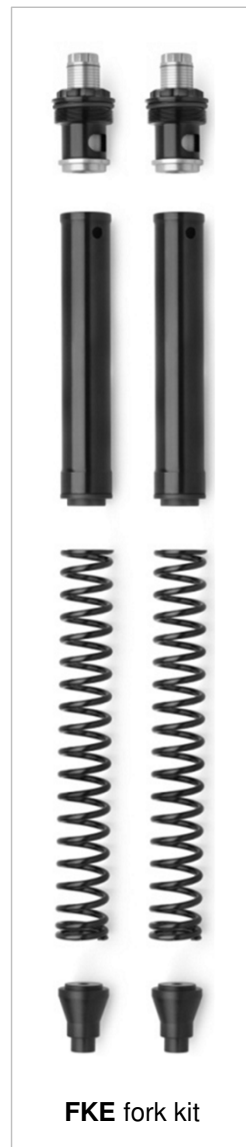
FKE fork kit