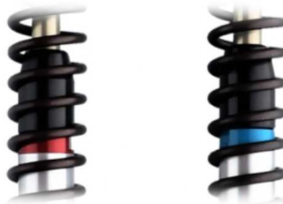
Cartridge Blue ring Rebound feature