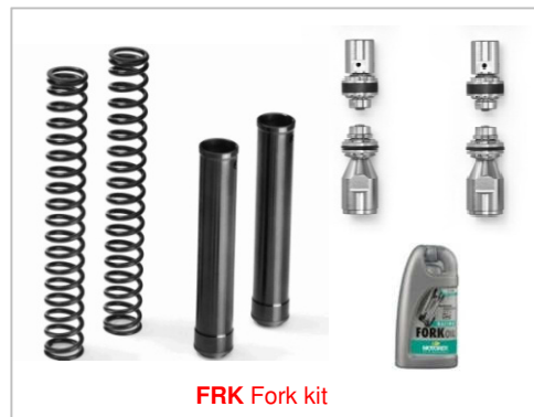
FRK Fork kit