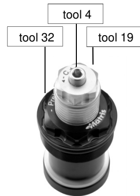
F15K "quad valve system" fork kit