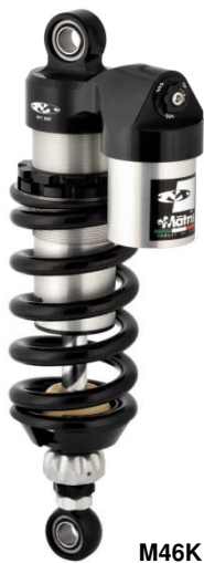
Dark Series (on demand)