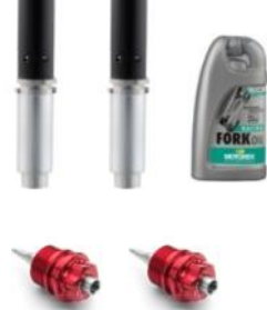
F25R fork kit