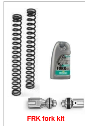
FRK fork kit