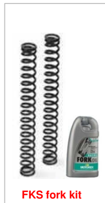
FKS fork kit