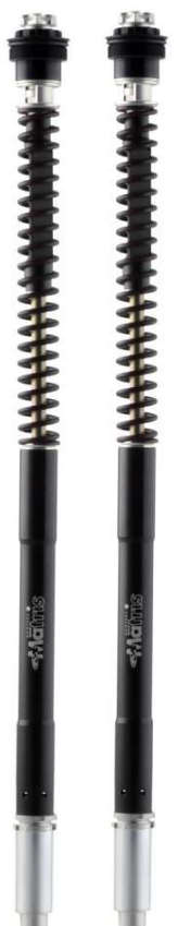
F25R fork kit