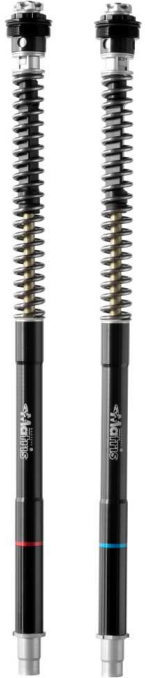
F25SA fork kit