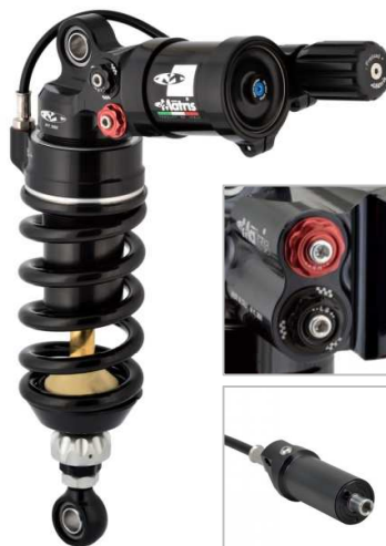
M46R Dark Series (on demand)