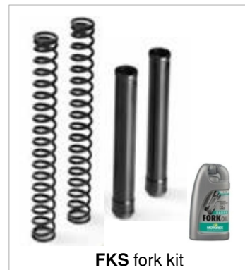
FKS fork kit