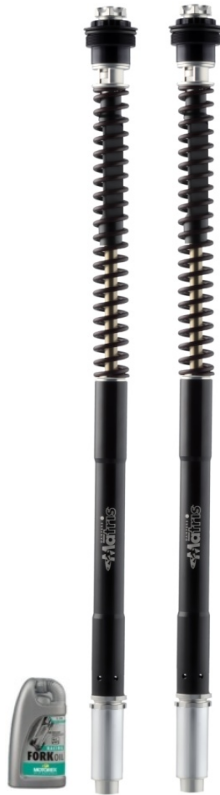
F25R fork kit