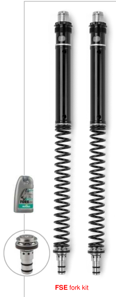
FSE fork kit