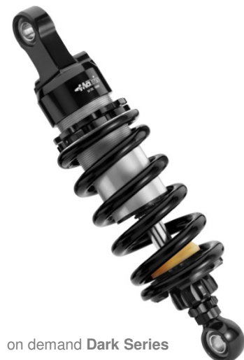
on demand Dark Series

R = Rebound adjustment / regolazione Estensione L = Length adjustment / regolazione Interasse P = spring Preload / Precarico molla