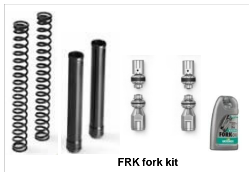
FRK fork kit