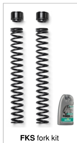
FKS fork kit