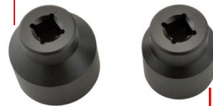
T22 fork cap tool 28 (6 sides)