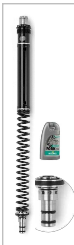
FSE fork kit