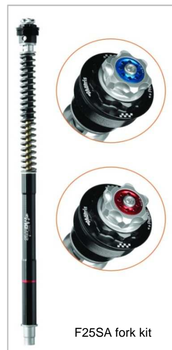
F25SA fork kit