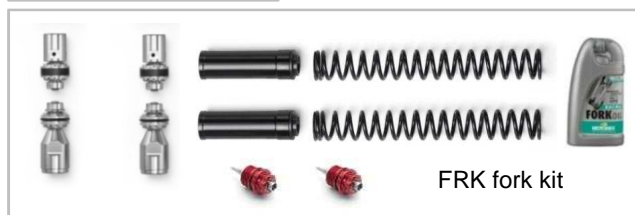
FRK fork kit