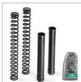
FKS fork kit