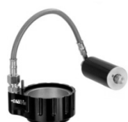
P2 hydraulic Spring Preload