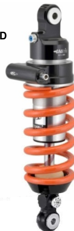
Dark Series on demand