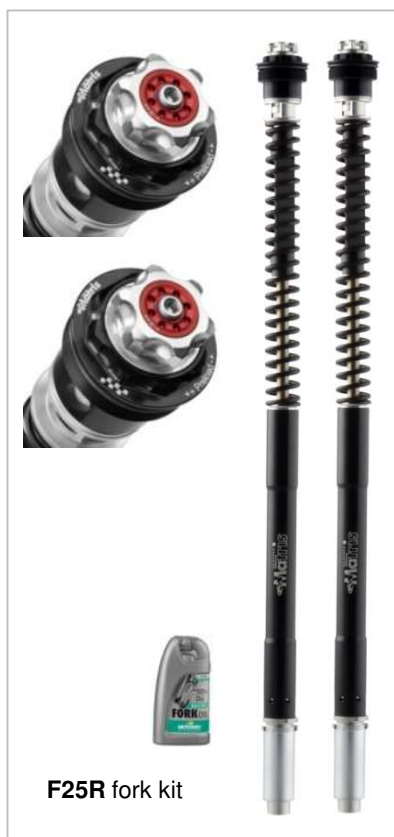
F25R fork kit