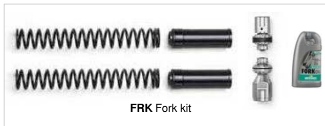
FRK Fork kit