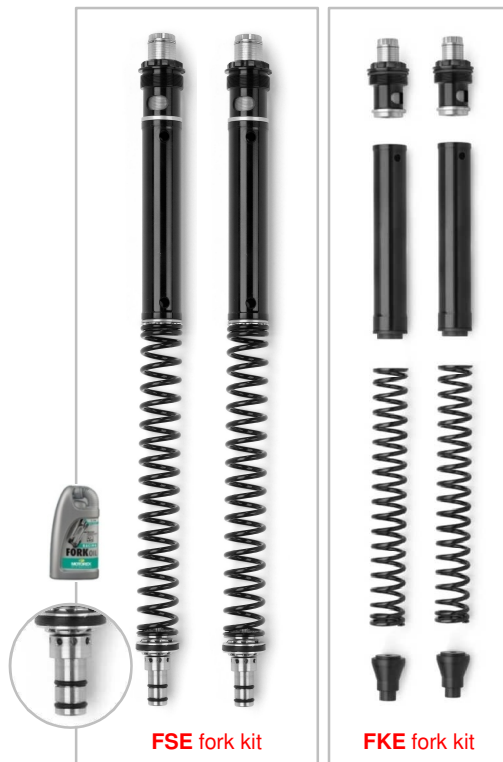
FSE fork kit