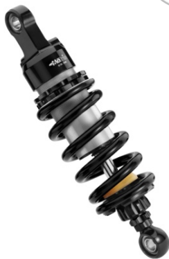
on demand Dark Series