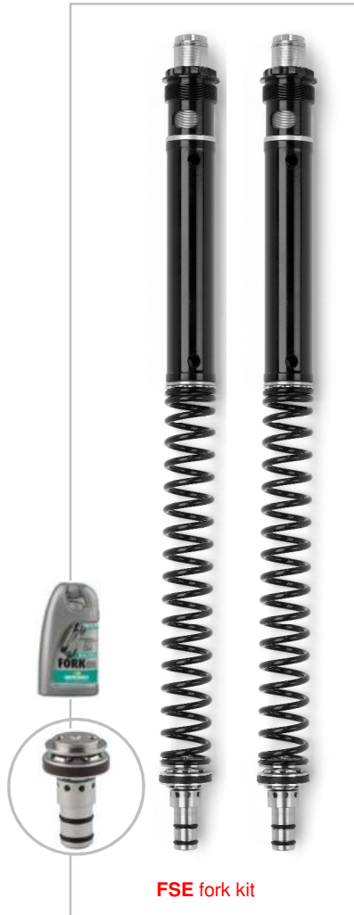
FSE fork kit