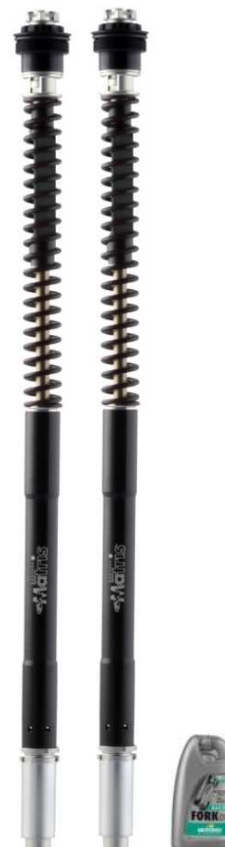
F25R fork kit