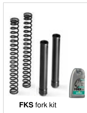
FKS fork kit