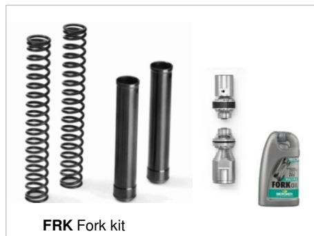
FRK Fork kit