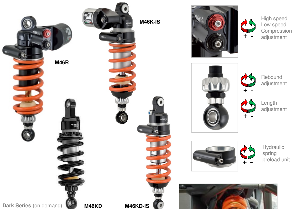
Dark Series (on demand)