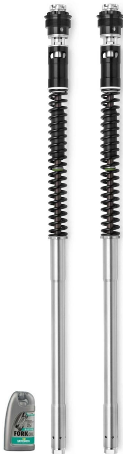
F20K fork kit