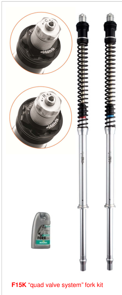
F15K "quad valve system" fork kit